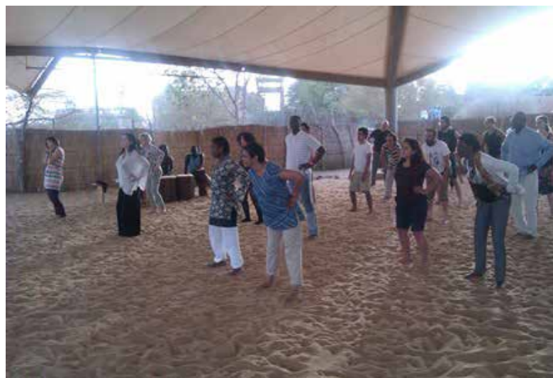
Dancing at l'école des sables

The second Assembly of Art Collaboratory was a very good meeting for the sharing and exchange of knowledge. For me it was the first time to participate in an Arts Collaboratory Assembly, but it was as if I had already participated in several other before. This meeting allowed me to understand and deepen my knowledge of my mission to help my institution Centre d'Art Picha. I realized that Art Collaboratory is a common well of knowledge where everyone could come to draw and add to the sharing of knowledge.