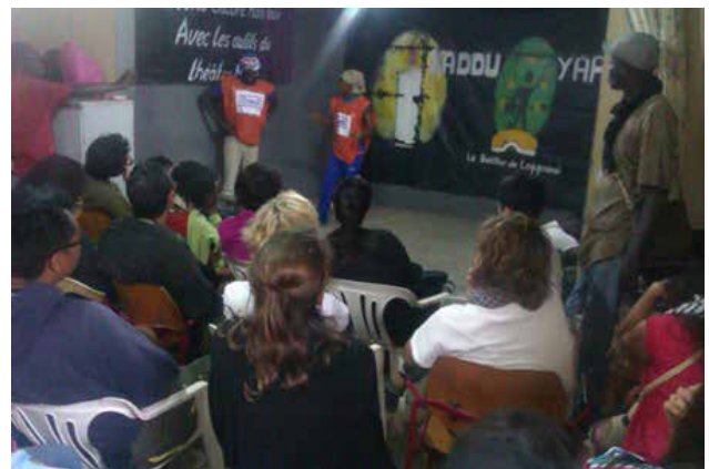
The participants assisting in a play at the theater of Kadou Yarax

And many other discoveries thanks to this Assembly.