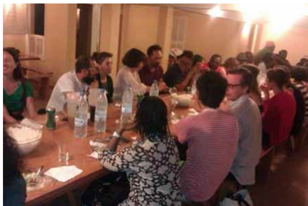
Dinner at l'école des sables

The Art Collaboratory partners Doen and Hivos Foundation are not only financial support platforms with different structures around the world. They also help encourage the development of the methodology of the four collaborative projects of Arts Collaboratory that were born during the first meeting in Indonesia. The annual meetings are the structures for coming together to get to know each other and exchange ideas on various joint projects.. These meetings are always born of new initiatives for the future, while the collaborative projects were born in order to create a common space. In terms of financial support from the network it is the only platform that balances the stability and durability of structures, because it gives structural support to all these diverse institutions unlike other donors who finance for specific projects.