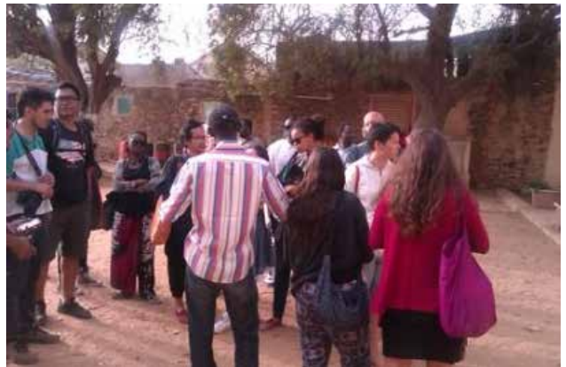
Our guide speaking about the history of Gorée Island