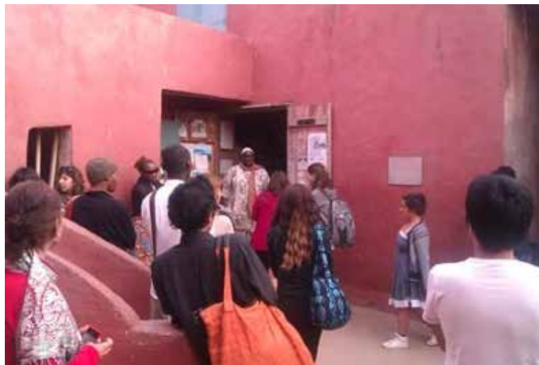
Introduction by the director of the House of Slaves