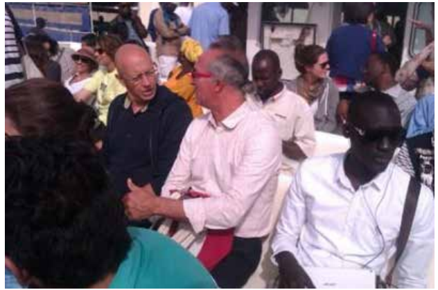
On the ferry to Gorée Island in the Atlantic Ocean